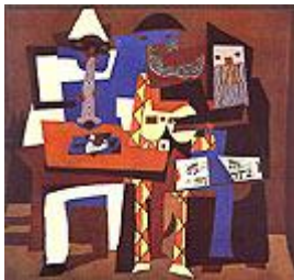
Three Musicians, 1921