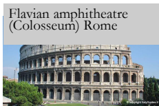
Flavian amphitheatre (Colosseum) Rome

You arrive in Rome at 11:50 a.m. The group will be met by an English-speaking guide, who will whisk you off to your first tour. Rome boasts an unrivaled 3,000-year heritage of art and architecture. You will see the Roman