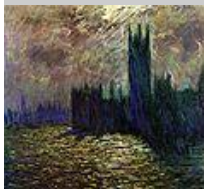
Houses of Parliament, London, Musée Marmottan

Everyone loves Impressionism, a style that was birthed right here in Paris. You will spend the morning at the Musee d'Orsay, which houses the world's best collection of Impressionists and Post Impressionists – Monet, Renoir, Van Gogh, and Gauguin. You will also learn about the Christian-inspired Realism of Millet. In the afternoon, you will tour the Musée Marmottan for some of the best-known pieces by Monet. A cruise down the Seine sets us up nicely for dinner at a local restaurant. BD